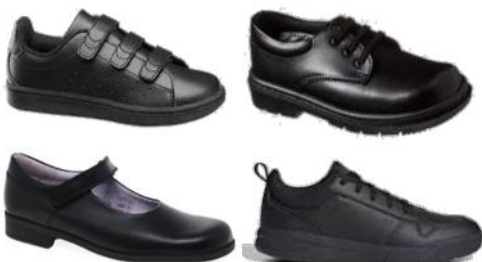
Plain black shoes with no visible branding

clearly outlines the expectations on footwear, both for PE uniform and the main school uniform.